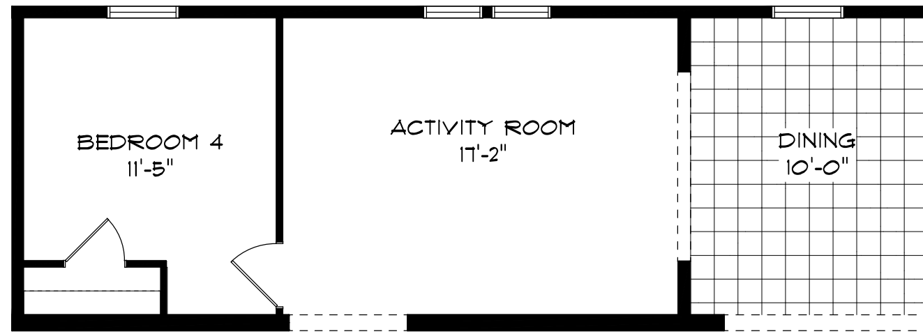
4 BEDROOM 2 BATH OPTION